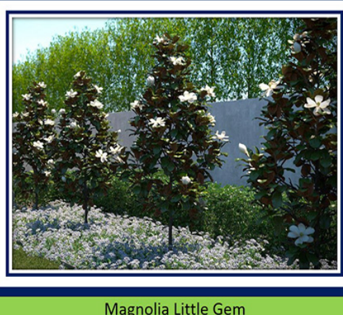
Magnolia Little Gem